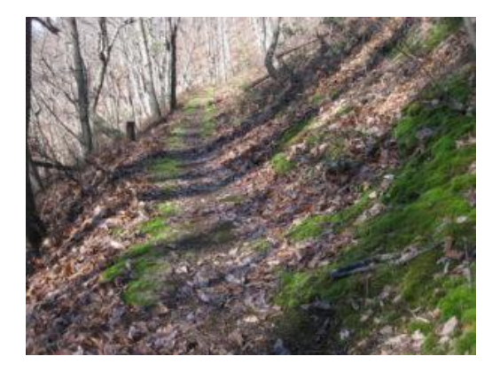
Glenwood Horse Trail – Directions – Conveniently located at 3022 Pico Road, this trail is just minutes away from downtown Buchanan by way of Parkway Drive. You may also access this trail from the Blue Ridge Parkway at Bobletts Gap. Drop in behind the picnic table at the Bobletts Gap parking lot onto a short trail that takes you to Boblett's Gap fireroad, also known as Chair Rock Road. Turn right, dropping down exactly 1 mile on a sometimes rocky, sometimes water-holed blast of a 5% downhill.

ride follows the gravel and hard-packed, wide Glenwood Horse Trail, and the rest traverses the Blue Ridge Parkway. Be sure to yield the right of way to horses. Although there are some decent ups and downs, the 21-mile distance is the only limiting factor for less-experienced riders.