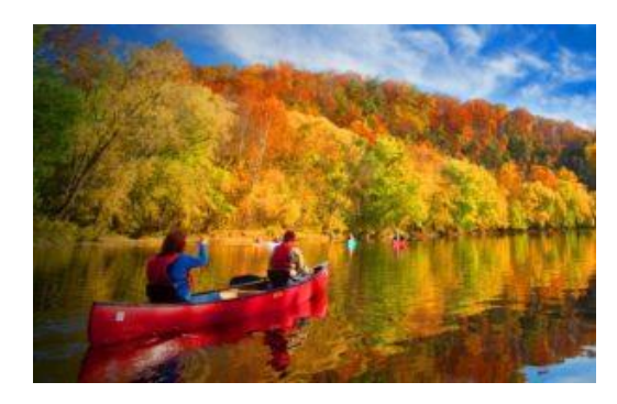
Explore fall colors in a whole new way by river.

In November of 2016 Travel & Leisure Magazine designated the Upper James River Trail as one of the best, easy outdoor adventures in the world.