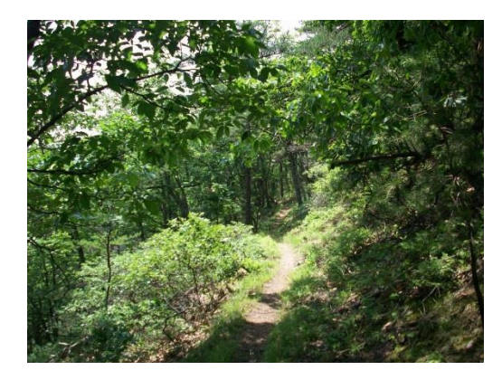
Spec Mine Trail – Found at milepost 96 on Blue Ridge Parkway – This trail circles around Iron Mine Hollow and Spec Mines Branch, above the 19th-century Spec Mines, as it drops 1,300 feet in 2.8 miles to VA 645. Along the way, it passes a large pine tree the Forest Service has posted as a "designated wildlife tree," not to be cut.

National Forest along the western side of the Blue Ridge below the Parkway. Best trailhead