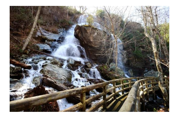
Apple Orchard Falls is a moderately difficult, 7.5-mile hike but offers a great waterfall at the end as a reward.

Apple Orchard Mountain was named for the nature of the dominant northern red oak forests on its summits and ridges. The weather is so severe on the upper elevations of the mountain that the trees have taken on a stunted appearance, as if they have been trimmed and pruned over the decades. The Appalachian Trail and the Blue Ridge Parkway pass within a short distance of the top of Apple Orchard Mountain.